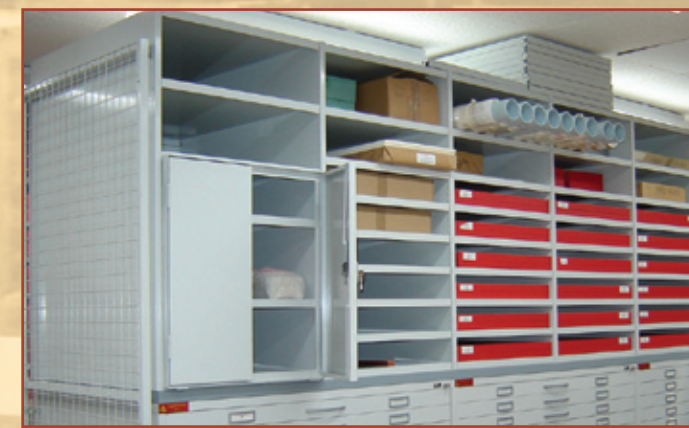
FAMI drawer cabinets at the National Army Museum

Not only does this eliminate damage to the fabric of the building, it also means that the units can easily be moved to a new location, something that could be necessary as the Museum's refurbishment plan proceeds.