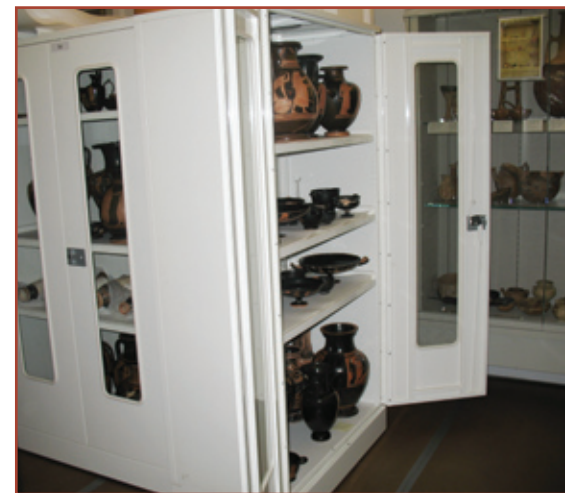
Temporary storage during a major gallery refurbishment project at the Fitzwilliam Museum

To complement the full-size double-door Clearview cabinets, System Store Solutions offers Clearview Compact museum cabinets. These are constructed from mild steel with double-skin side walls. They feature lockable doors with vision panels, and adjustable clipped shelves.